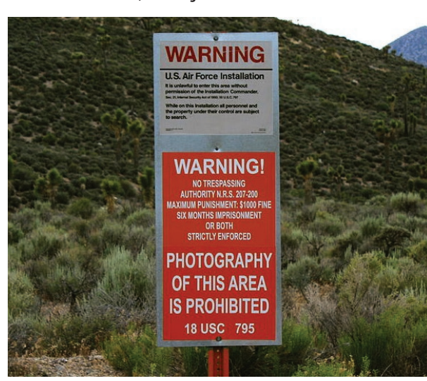
Signs trespassers encounter upon entering Area 51.