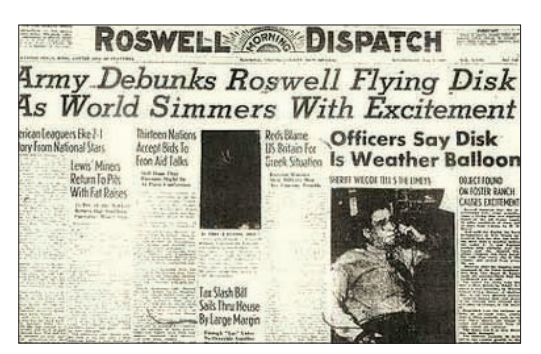
Newspaper retracting the "flying disk" claim.

Today, more than 60 years later, there are people who passionately take one side or the other.