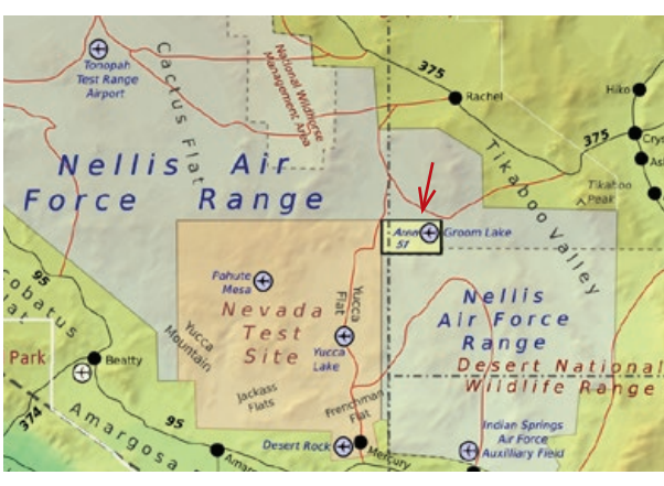
Federal lands in Nevada, including Area 51.

In case there was any doubt that an intruder was entering forbidden territory, there are signs that read: "Stop here!" "Unexploded Ordnance!" "Contaminated Area!" "Radiation" and "Use of Deadly Force Authorized." People persistent or foolish enough