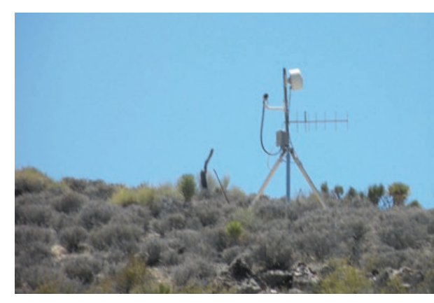
One of the many surveillance cameras in Area 51. The entire area abounds with advanced sensors, capable of picking up movement, sound and even human smell.

106 | ZMAN- May 2014 | ZMAN- Iyar 5774 | 107